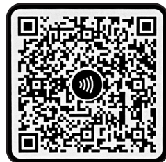
Misericordia Community Hospital