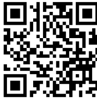
Misericordia Community Hospital