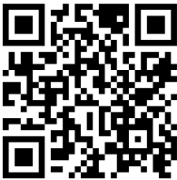
Grey Nuns Community Hospital

Visit our Obstetrics page to see our Taking Care of Yourself and Your Baby and Getting Breast Feeding off to a Great Start documents.