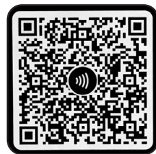
Grey Nuns Community Hospital

A discount rate parking pass is available if your baby needs to stay in the Neonatal Intensive Care Unit. Please check with your nurse.